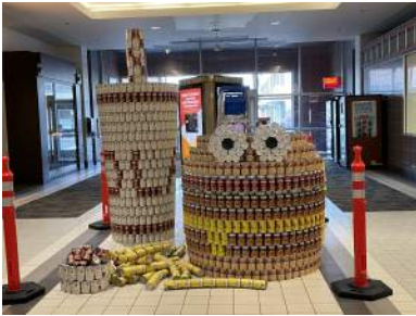
Enterprise Engineering, Inc. 2023 - MOST CANS