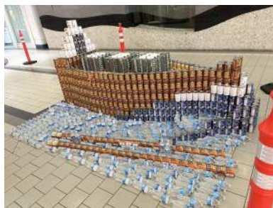
R&M Consultants, Inc. 2023 - BEST USE OF LABELS

sign-up link coming soon (~10/06). Check our facebook, instagram, website.