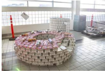
Rim Architects / Reid Middleton, Inc. 2023 - BEST ORIGINAL DESIGN 2023 - STRUCTURAL INGENUITY