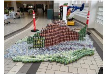
CRW Engineering Group, Inc. 2023 - PEOPLES CHOICE